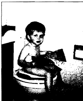
It's never too early to start reading for comps.

Remember when you read that you are studying these texts, not reading for pleasure or entertainment. You'll want to familiarize yourself with the author, plot, major characters, and basic themes before reading. This will allow you to focus on the finer points of character, setting, narration, etc., instead of wasting your time on more general aspects and comprehension. To that end, read the editor's preface or introduction essay prior to reading the text. You should also consult a study guide (crazy as it sounds, Cliff's Notes or www.sparknotes.com are especially helpful) before reading.