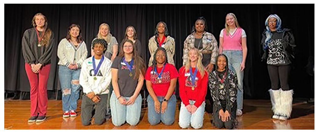
First-year student awardees at the 14th Annual Showcase for Student Writing.

Our English faculty, staff, students, and alumni are consistently enhancing their academic and larger communities. Below are a few of the many exciting contributions and achievements from 2022-2023.